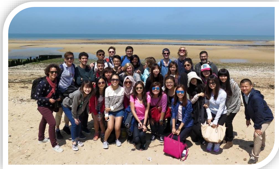
Angers Summer Programme 2015